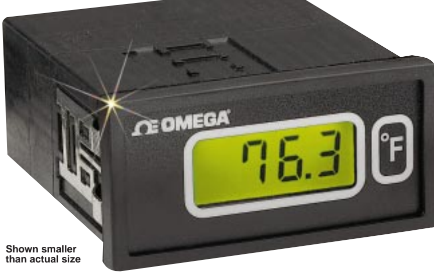
Shown smaller than actual size